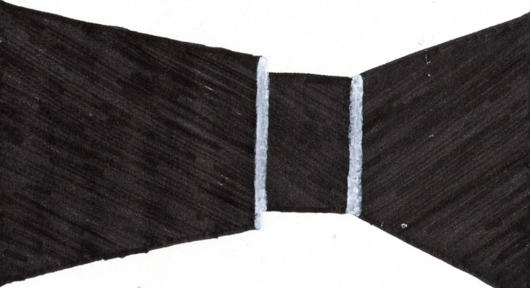
A Corner in the Tunnels