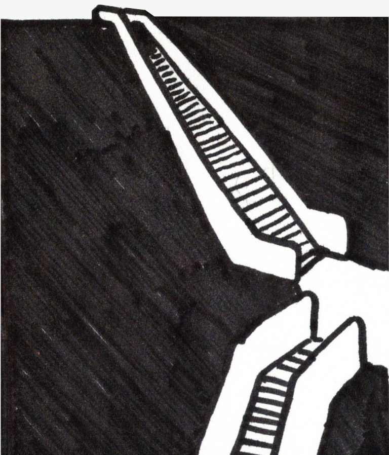
Eaton Centre Escalators