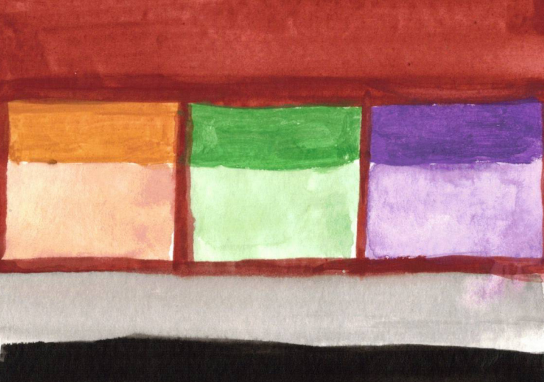
Storefronts on Dundas West