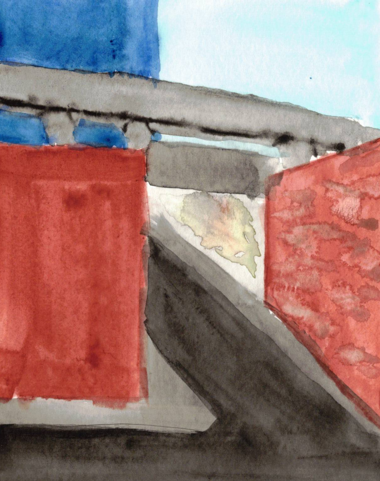
New Barrie Line Guideway